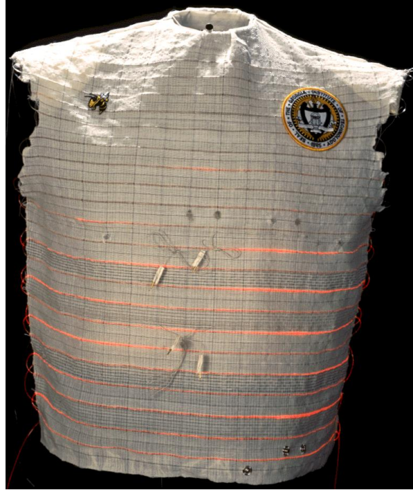
Figure 3. Georgia Tech Wearable Motherboard [18].

Before clothing became a means for self-expression, it protected its wearer from the hazards of the surrounding environment by providing a barrier between the skin and the elements. Traditional clothing is restrained to protecting the wearer from weather, but with the development of smart textiles, the protection capabilities of clothing expand as sensors can detect changes in the wearer's surroundings that result in danger. Sensors made by plastic fiber optics have been used in soldier uniforms to detect chemical and biological threats, above-normal temperatures, and other hazards [20]. Optical sensors operate by measuring changes in light intensity at the end of the fibers. When the light is less intense, the fiber has been deformed. For chemical optical sensors, the fibers are coated in layers that react with specified chemicals, the reaction causes the fibers to degrade, changing the intensity of light transmission.